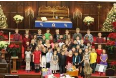
At left: K-4 grades sing "Happy Birthday, Jesus"